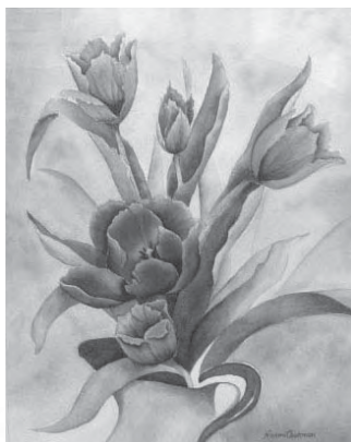
←----- Pitcher Of Tulips Naomi Cashman Watercolor