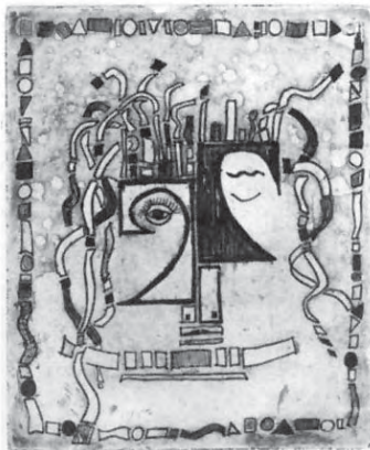
Intaglio Etching titled, Left & Right

I have been inspired by and creating art for a number of years and continue to grow in love with "painting our lives" and "putting my heart....my passion" for the arts on display.