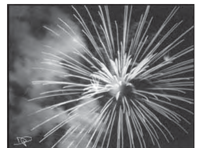
-----> 2nd Place Neon Shock