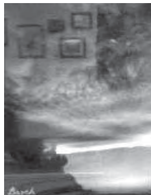
-----> Evening Hail Clouds