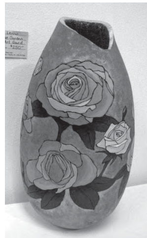
←----- 3rd Place Wild Rose Garden Angela Lexow